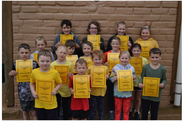
Age group champions

Congratulations to the following age group champions: